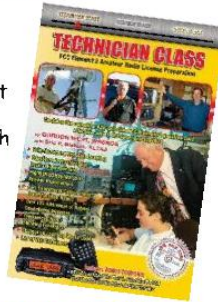
Book for Class