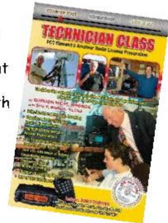
Book for Class