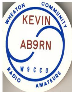
Option 1: keep it the same