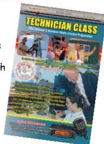
Book for Class