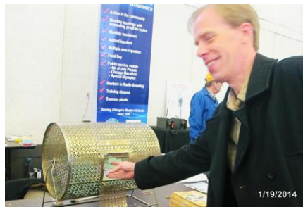
A ham tosses in his "Lucky" ticket.

The Club's Mobile Communication Support Unit and all Exhibitors stood ready as the visitors headed for the drawing barrel to deposit the raffle ticket stubs. Spreading out through the Exhibit Hall, Hams scooped up bargains and "hard to get" parts.