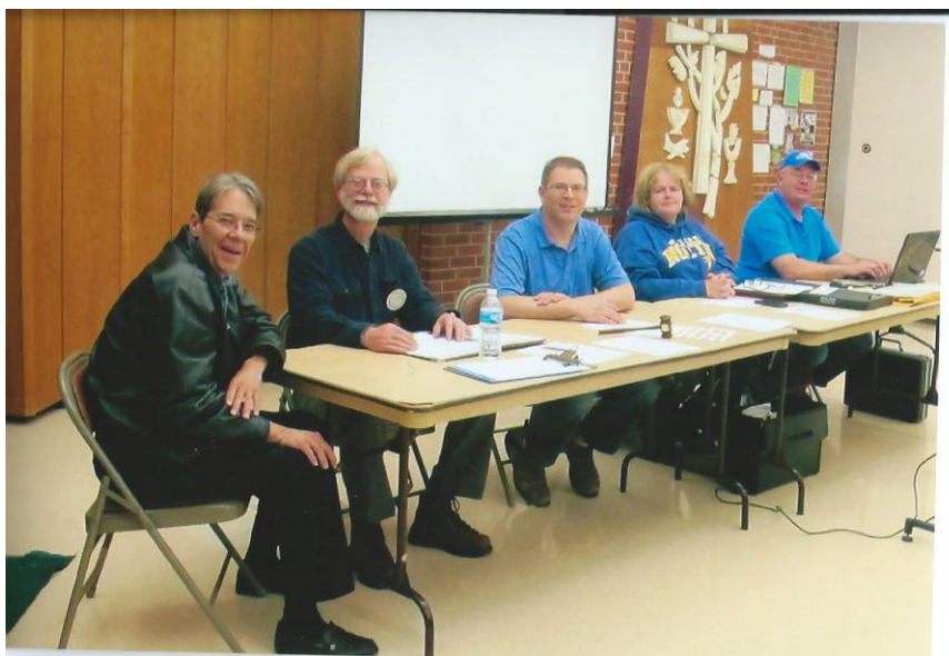
Introducing the 2013/2014 Board of Directors (From Left to Right)