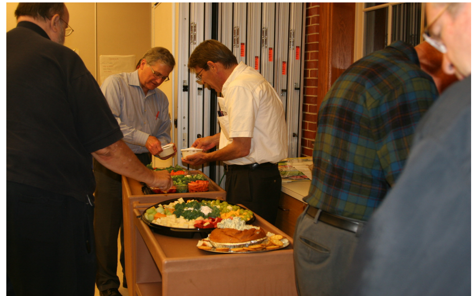
WT9Y and NJ9E share some food.