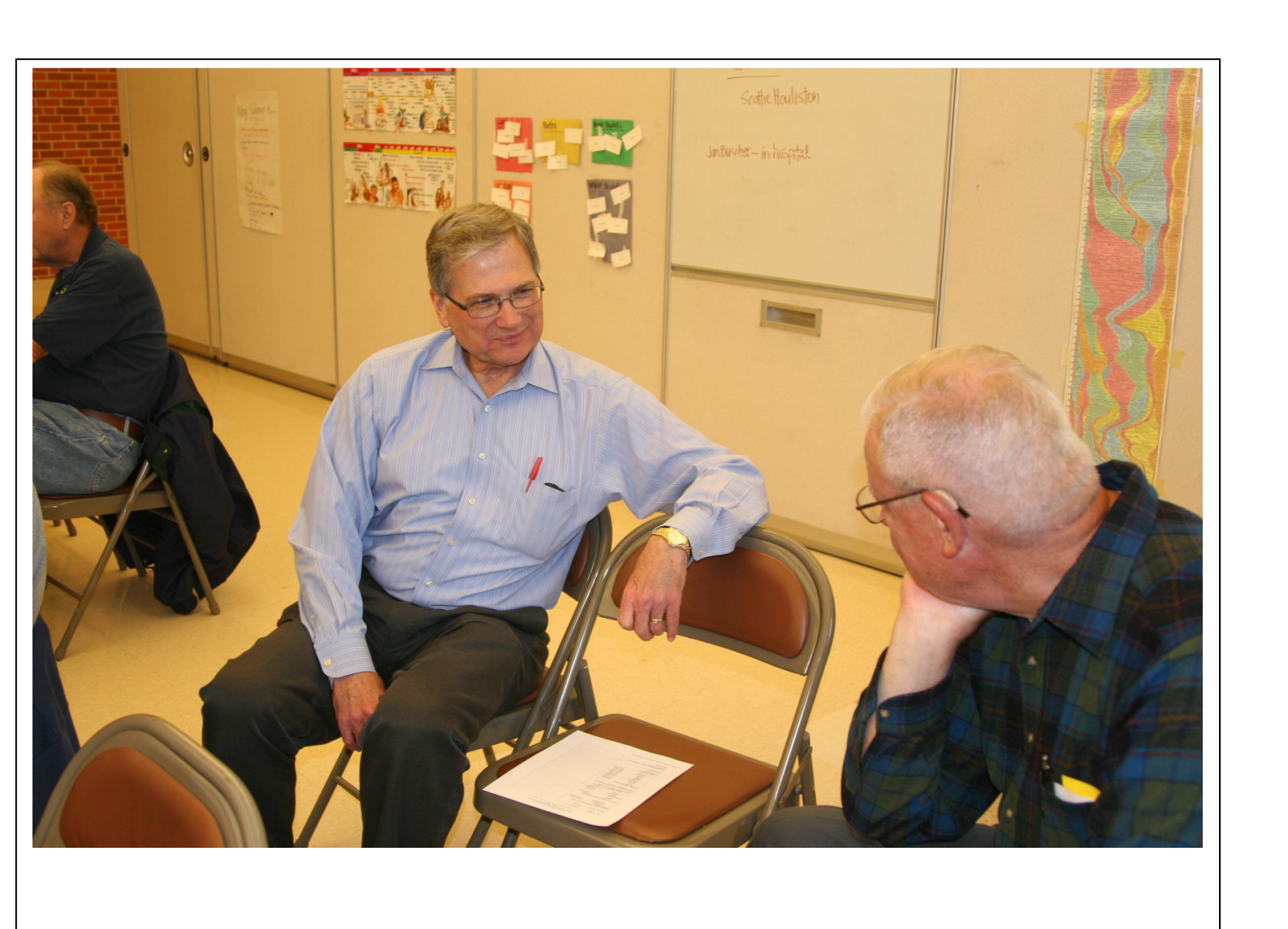
WT9Y and W9UZ enjoy one last conversation