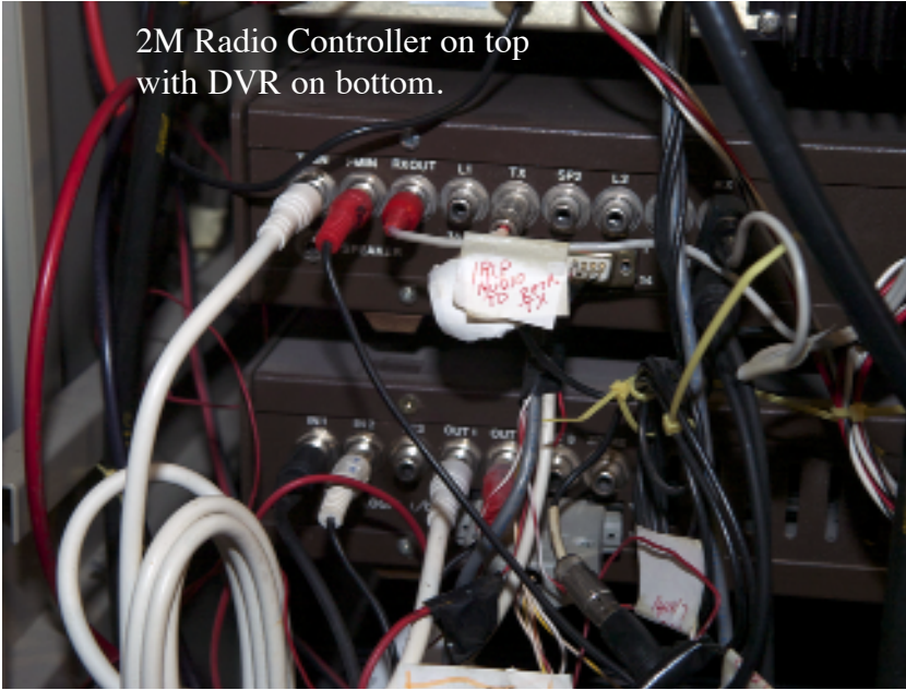
2M Radio Controller on top with DVR on bottom.

Some of the membership has mentioned that they either don't know what the RAB does or do not understand what the club constitution has charged the RAB with accomplishing. With the beginning of this article we will attempt to bring everyone up to date on what has been happening with the Club's repeater systems and why.