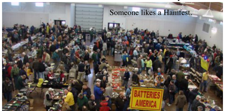
Someone likes a Hamfest.