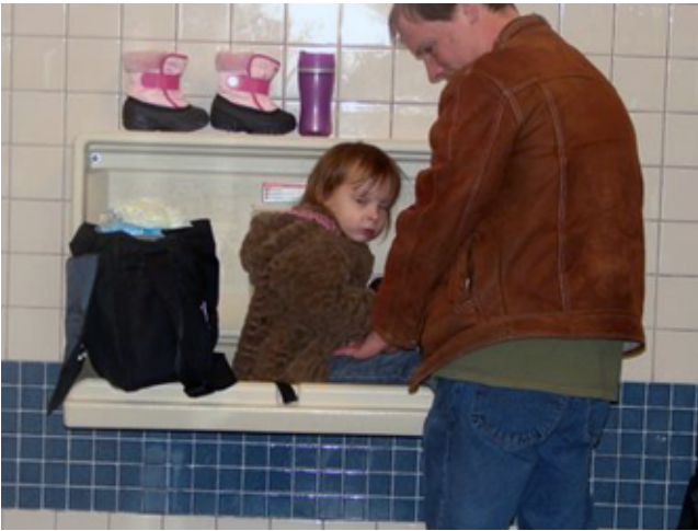
Time Out for a Diaper Change.