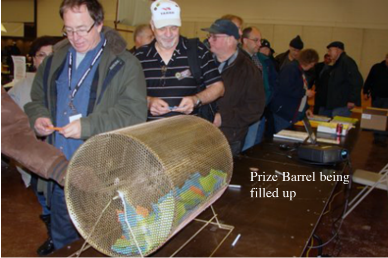
Prize Barrel being filled up

Grand Prize winner did NOT have to be present to win, there was a crowd at the stage ready to accept the Lucky Cash envelope.