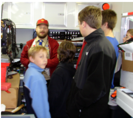
Scouters learn all about the CSU capabilities