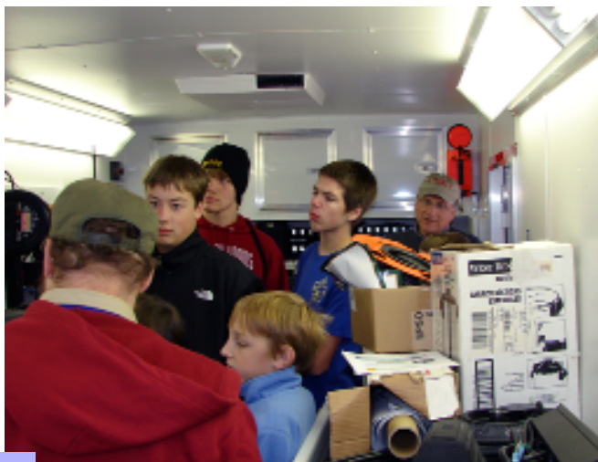
Parkview School Troop gets a tour of the CSU