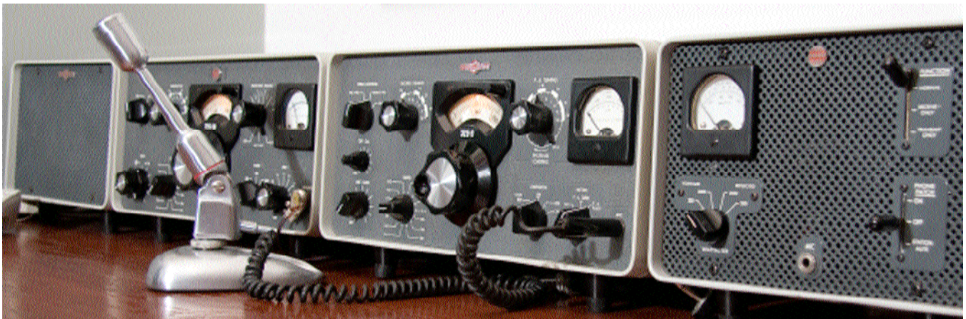
Above: Collins S/Line – 516F-2 power supply, 75S-3B transmitter, 32S-3 receiver, 312B-4 console, SM-1 microphone, circa 1969