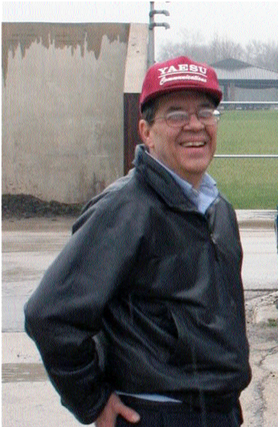
CSU clean-up day on a not to dry a day