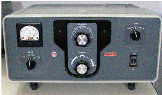
At Right: Collins 30L-1 Amplifier 1970