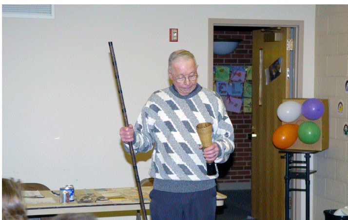
Aiming to 'kill' a balloon in the corner.