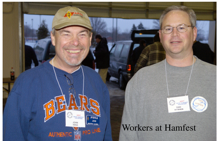
Workers at Hamfest