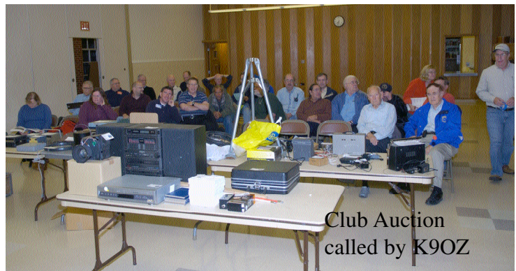
Club Auction called by K9OZ