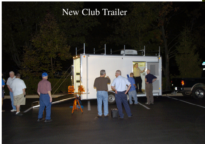
New Club Trailer