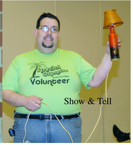
Show & Tell