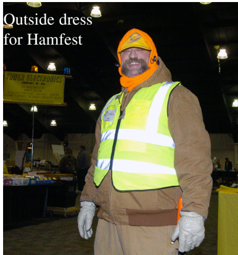
Outside dress for Hamfest