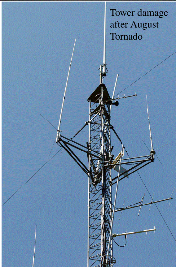
Tower damage after August Tornado