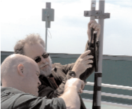
“Well look at that would you.”