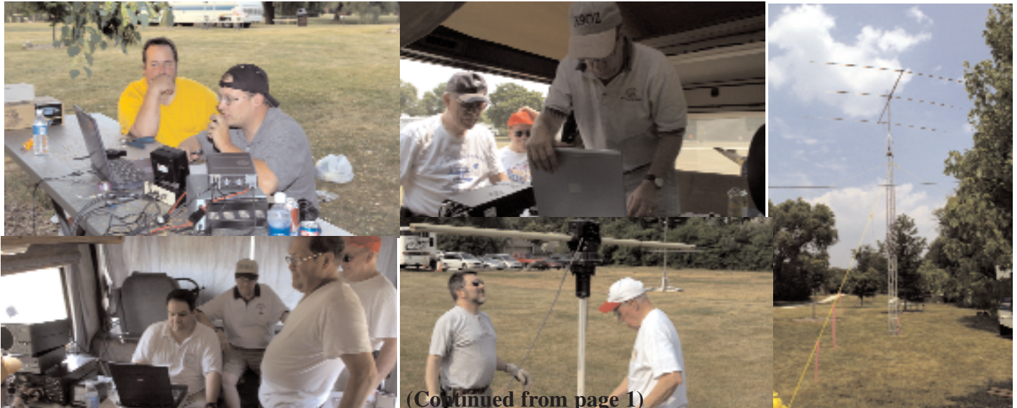
(Continued from page 1)

That's a total of 743 contacts -- 2,972 points. My guess is that will be a high percentage of the club's overall score -- done with four operators using an "old, outdated mode."