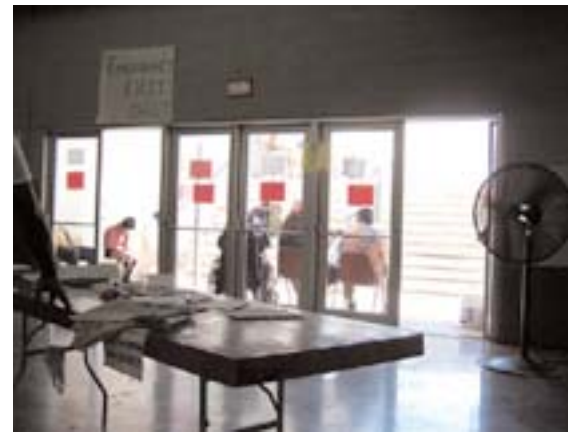
The smoking 'lounge' with signin table in foreground