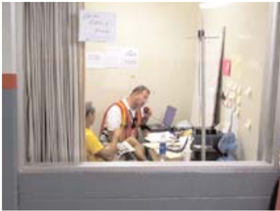
The radio room where net control for amateur radio operation was located