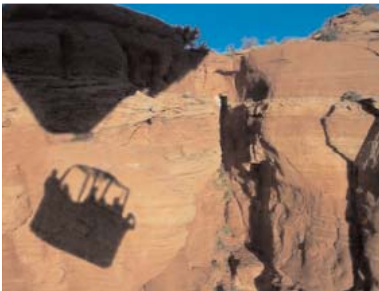
Finalist in the “Last Photo I Ever Took”