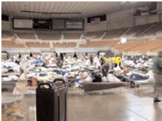
The main floor of the Coliseum