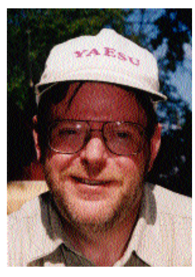
Activities on the HF Bands by: Peter Barr W9UF

More details were released recently regarding the upcoming second Ducie Island DXpedition. Activity is expected on March 8th or 9th, depending upon seas and weather. Stu,WA2MOE, states the callsign will NOT be released or announced just before the operation begins to avoid slim activity. The announcement will come from Kan,JA1BK, or Stu. The operators will use SSB, CW and RTTY from three sites on all HF bands, 6 meters and the AO-40 satellite. However, the main bands to be used will be 20 and 15 meters (QRV 24 hours). The organizer is Kan, J A1BK. Operators will be Dieter, DJ9ON(CW), Hans, DK9KX(CW), Philippe, FO3BM(6m SSB), Hiro, JA1SLS(CW/SSB), Yuichi, JR2KDN(SSB), Doug, N6TQS (SSB,AO-40),