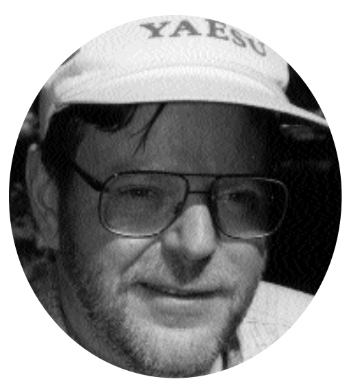
Activities on the HF Bands