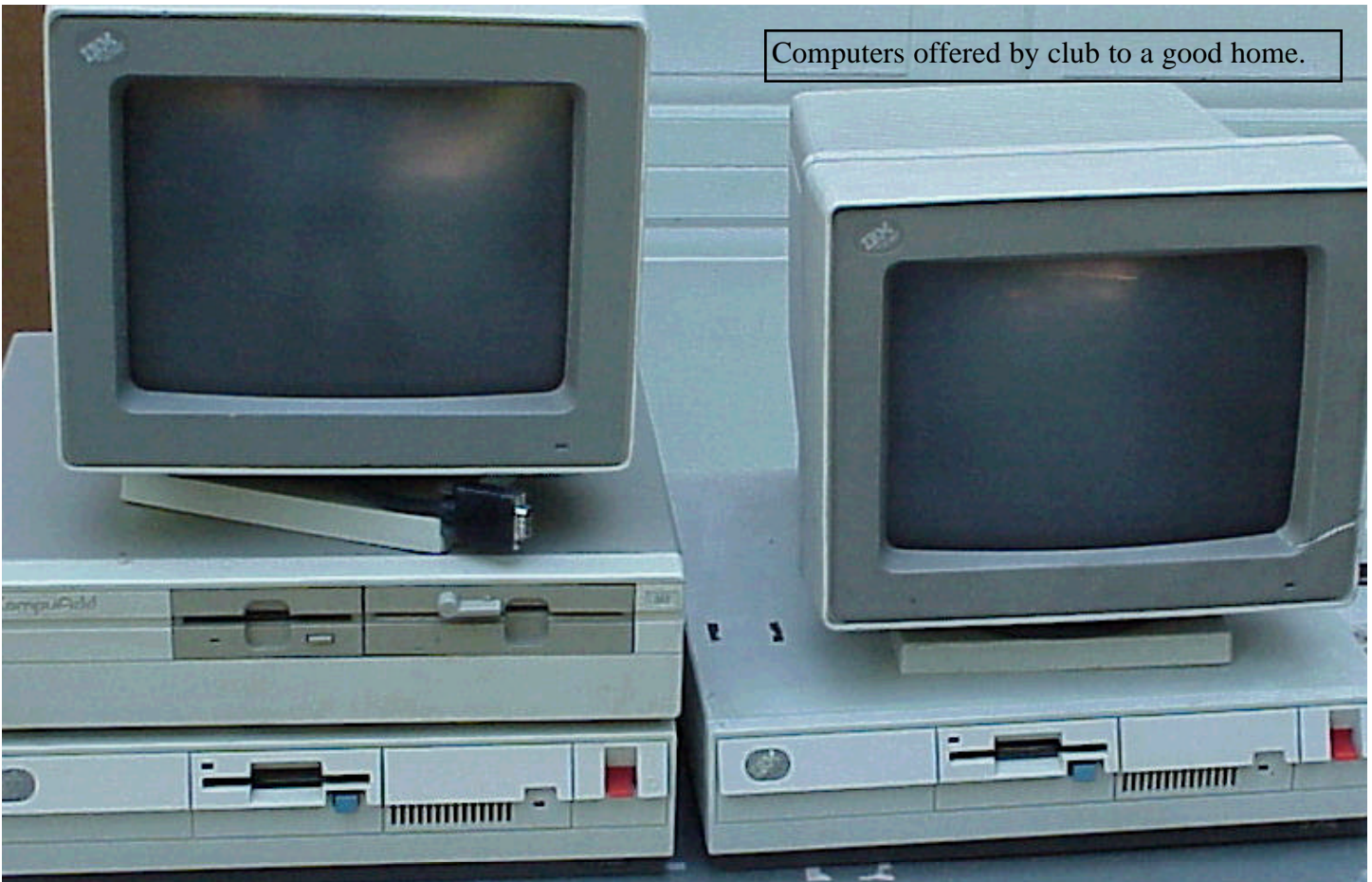
Computers offered by club to a good home.

So mark January 26 on your calendars for helping at the hamfest.