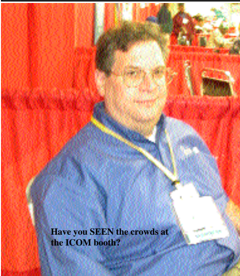
Have you SEEN the crowds at the ICOM booth?