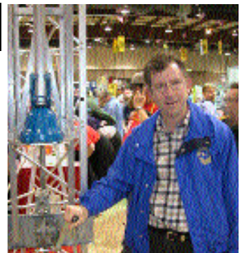
Would this work at COD?