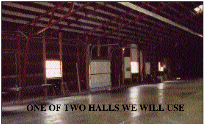
ONE OF TWO HALLS WE WILL USE