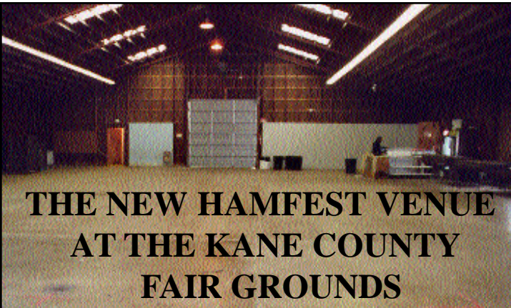
THE NEW HAMFEST VENUE AT THE KANE COUNTY FAIR GROUNDS

WCRA WOULD LIKE TO WISH EVERYONE A VERY MERRY CHRISTMAS AND A HAPPY NEW YEAR