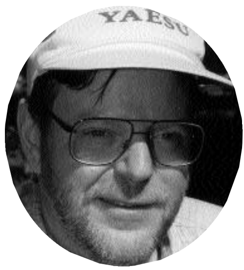
Activities on the HF Bands