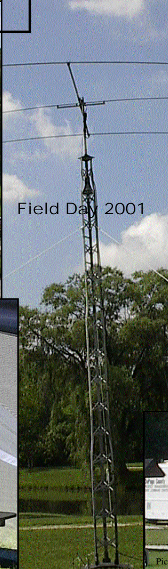
Field Day 2001