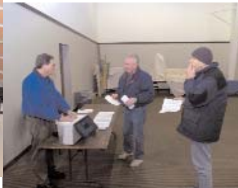
2005 in Review